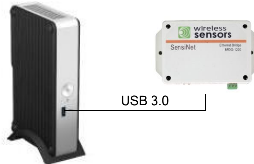
Model: GWAY-2100 and BRDG-1222

The SensiNet® Services Gateway is a powerful appliance providing network management, user interface, data logging, trending, alarming and communications without any complicated software to install. A standard browser and network connection is all that's required to access and configure the system. The GWAY-2100 also operates as stand-alone data logger with real time views, trending and e-mail alerts.